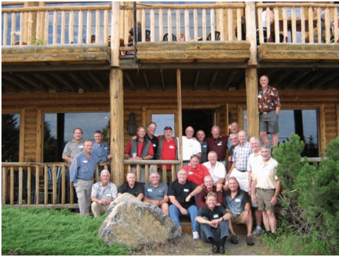
FLATHEAD LAKE BROTHER REUNION - AUGUST 2010