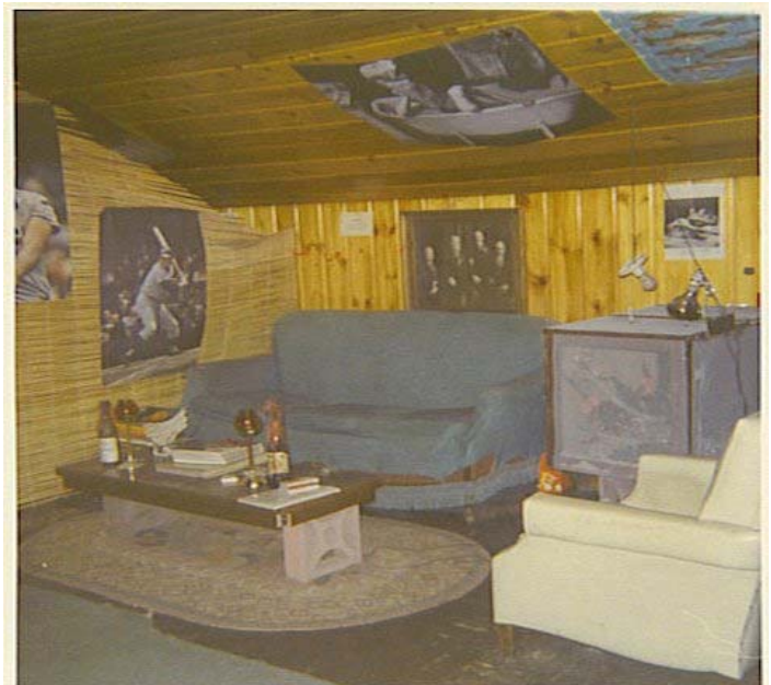
BEHIND THE BAMBOO CURTAIN: SIBERIA 1970

Beta Delta hosted returning brothers, friends and sweethearts to witness the Grizzlies squeek out a 28-25 victory against Sacramento State on September 25, 2010. The brothers gathered at 1110 Gerald to reconnect and share memories.